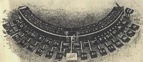
Scientific IDEAL Keyboard.